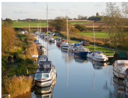
Martham Boat Dyke Trust